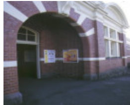
caulfield railway station normanby road caufield side detail jan1998