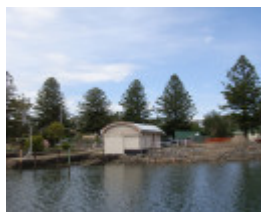
LIFEBOAT STATION SOHE 2008