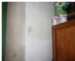
LIFEBOAT STATION SOHE 2008