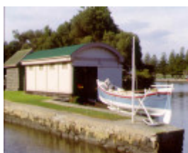
1 lifeboat station port fairy sw aug1999