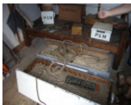
LIFEBOAT STATION SOHE 2008