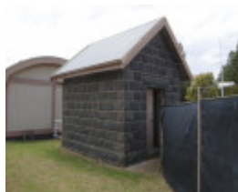
LIFEBOAT STATION SOHE 2008