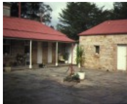
glenisl homestead glenisl via cavendish rear entrance jul1978