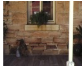
glenisl homestead glenisl via cavendish detail of stone wall sep1985