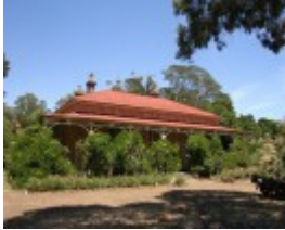
GLENISLA SOHE 2008