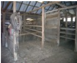
GLENISLA SOHE 2008