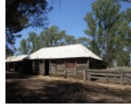
GLENISLA SOHE 2008