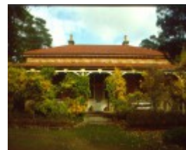
1 glenisl h444