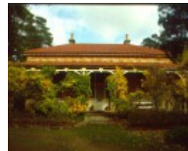
1 glenisl h444