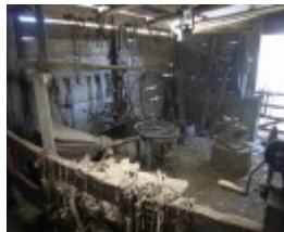
GLENISLA SOHE 2008