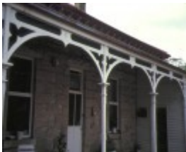
1 glenisl homestead glenisl via cavendish front of homestead jul1978