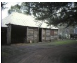
glenisl homestead glenisl via cavendish outbuilding jul1978