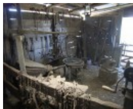
GLENISLA SOHE 2008