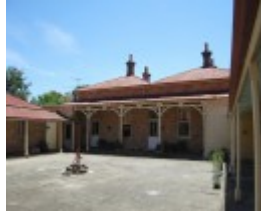
GLENISLA SOHE 2008