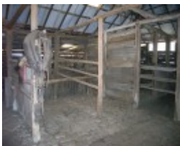
GLENISLA SOHE 2008