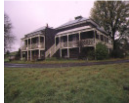
1 montpellier flour mill house calder hwy carlsruhe side view