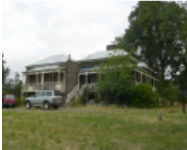
SKELSMERGH HALL SOHE 2008