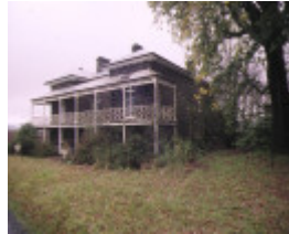
Montpellier Flour Mill House Calder Hwy Carlsruhe Front View