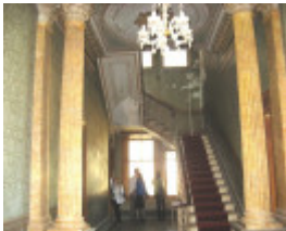
Mintaro stair hall