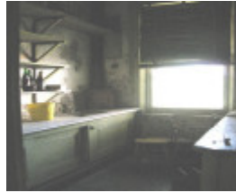
Mintaro butler's pantry