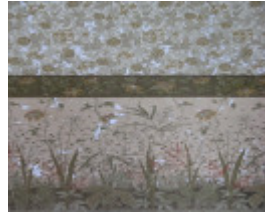
Mintaro wallpaper scheme