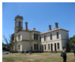
Mintaro from NW