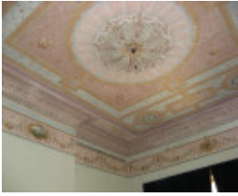
Mintaro drawing room