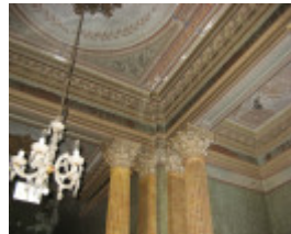
Mintaro entrance hall