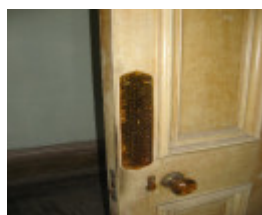
Mintaro door furniture