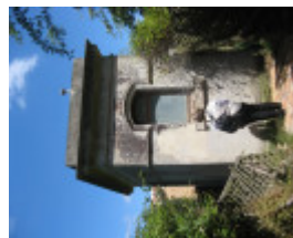
Mintaro detached toilet