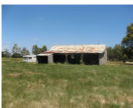
Mintaro former woolshed