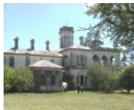
Mintaro from south