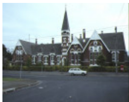
1 primary school number 2634 densham road armadale front elevation