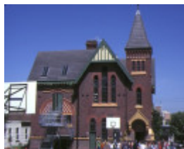
primary school number 2634 densham road armadale infant school front