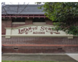
Infant school sign