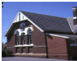
primary school number 2634 densham road armadale detail of front facade