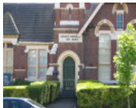
PRIMARY SCHOOL NO.2634 SOHE 2008