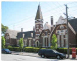
PRIMARY SCHOOL NO.2634 SOHE 2008