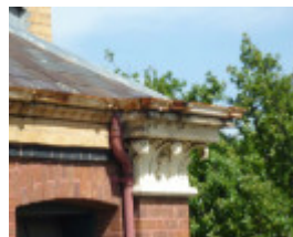
Before Photograph - Reference F3838 2014