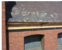
Before Photograph - Reference F3838 2014