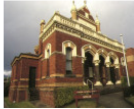
1 former moonee ponds court house mount alexander road moonee ponds front view 1994