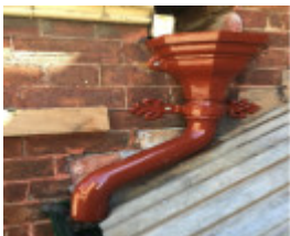
After Photograph - Reference F3838 2016