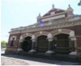
FORMER MOONEE PONDS COURT HOUSE SOHE 2008