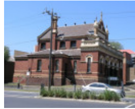
FORMER MOONEE PONDS COURT HOUSE SOHE 2008