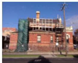
During Photograph - Reference F3838 2015