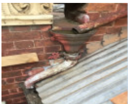
Before Photograph - Reference F3838 2014