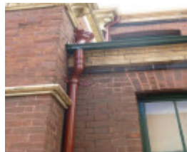
After Photograph - Reference F3838 2016