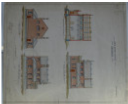
Essendon Court House Plan 1.jpg