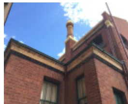
After Photograph - Reference F3838 2016