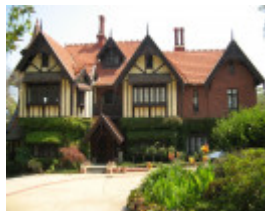
Tay Creggan_Hawthorn_KJ_Feb 09