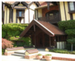
Tay Creggan_Hawthorn_front porch_KJ_Feb 09