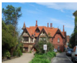
2976 Tay Creggan 30 Yarra Street Hawthorn Front 1 31