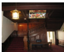
Tay Creggan_Hawthorn_hall_KJ_Feb 09