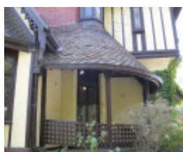
Tay Creggan_Hawthorn_KJ_Feb 09