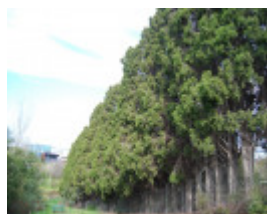
2976 Tay Creggan 30 Yarra Street Hawthorn Border Plantings 31