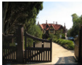
Tay Creggan_Hawthorn_front gates_KJ_Feb 09