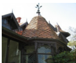
Tay Creggan_Hawthorn_turret_KJ_Feb 09