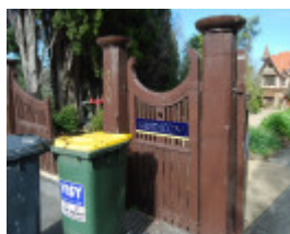
2976 Tay Creggan 30 Yarra Street Hawthorn Entrance 31