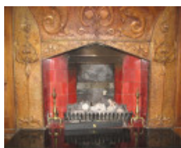
Tay Creggan_Hawthorn_billiard room fireplace_KJ_Feb 09