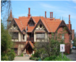
2976 Tay Creggan 30 Yarra Street Hawthorn Front 2 31