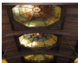
Tay Creggan_Hawthorn_domes in billiard room_KJ_Feb 09