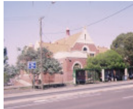
1 infant building & shelter shed coburg primary school no 484 bell street coburg front view feb 98