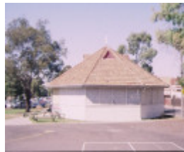
infant building & shelter shed coburg primary school no 484 bell street coburg pavilion feb 98