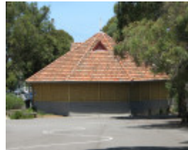
INFANT BUILDING AND SHELTER SHED, PRIMARY SCHOOL NO.484 SOHE 2008