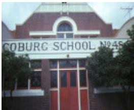
infant building & shelter shed coburg primary school no 484 bell street coburg entrance sep 84