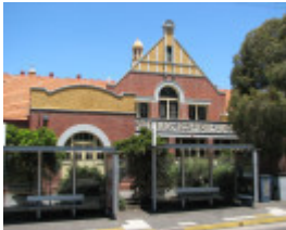
INFANT BUILDING AND SHELTER SHED, PRIMARY SCHOOL NO.484 SOHE 2008