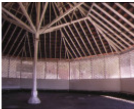
infant building & shelter shed coburg primary school no 484 bell street coburg interior of shelter feb 98