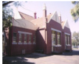
infant building & shelter shed coburg primary school no 484 bell street coburg side view feb 98