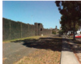
H01551 pentridge champ st frontage1 mar02