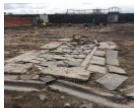
Pentridge excavation by Dig Intl