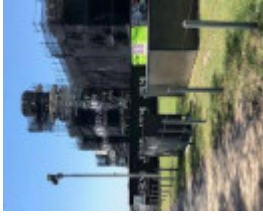
Repairs to B1