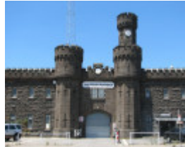
HM PRISON PENTRIDGE SOHE 2008