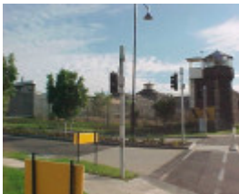
H01551 pentridge h division may 02