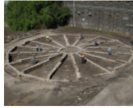
Pentridge excavation by Dig Intl