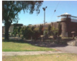
H01551 pentridge champ st frontage3 mar02