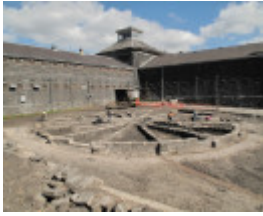
Pentridge excavation by Dig Intl