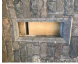
Repairs to B1