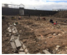
Pentridge excavation by Dig Intl