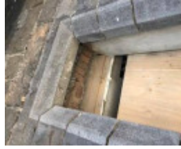
Repairs to B1