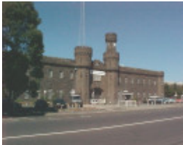
H01551 1 pentridge mar02