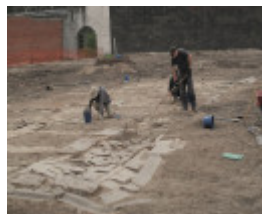
Pentridge excavation by Dig Intl