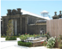
HM PRISON PENTRIDGE SOHE 2008