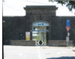
HM PRISON PENTRIDGE SOHE 2008