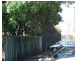
H01551 pentridge urquhart st wall mar02