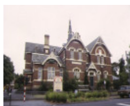
1 auburn primary school no 2948 front view