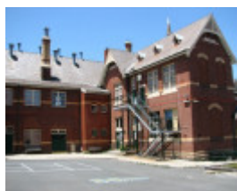
AUBURN PRIMARY SCHOOL NO.2948 SOHE 2008