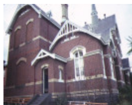
auburn primary school no 2948 side view jun 84