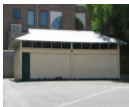
AUBURN PRIMARY SCHOOL NO.2948 SOHE 2008