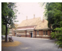
auburn primary school no 2948 infants room