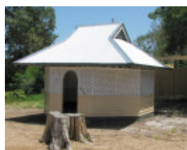
AUBURN PRIMARY SCHOOL NO.2948 SOHE 2008