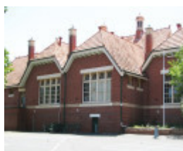
AUBURN PRIMARY SCHOOL NO.2948 SOHE 2008