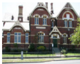
AUBURN PRIMARY SCHOOL NO.2948 SOHE 2008