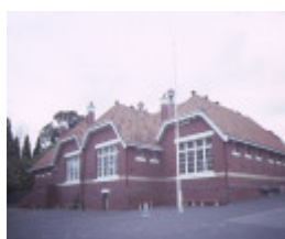
auburn primary school no 2948 rear view