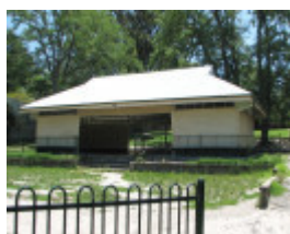
AUBURN PRIMARY SCHOOL NO.2948 SOHE 2008