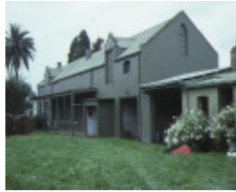
1 yering station melba hwy coldstream front stables