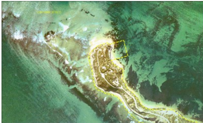
Point Nepean Plan