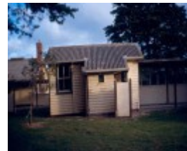
H02030 point nepean isolation hospital