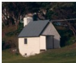
H02030 point nepean shepherds hut