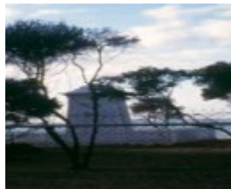
H02030 point nepean heatons monument