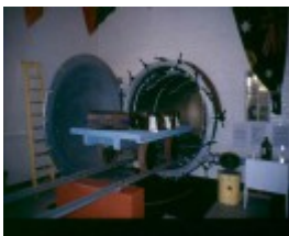
H02030 point nepean quarantine interior