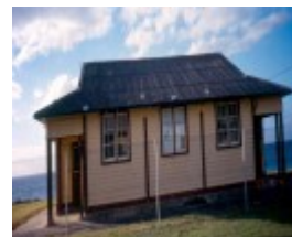
H02030 point nepean showerblock