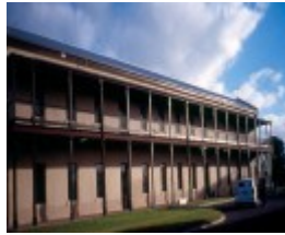
H02030 1point nepean hospital