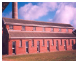
H02030 point nepean bathhouse2