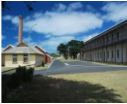
POINT NEPEAN DEFENCE AND QUARANTINE PRECINCT SOHE 2008