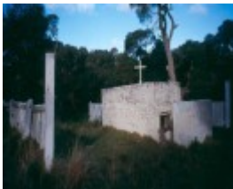
H02030 point nepean crematorium