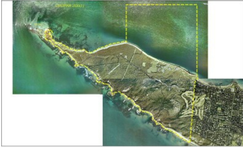
Point Nepean Plan