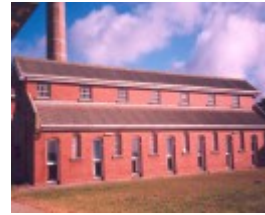
H02030 point nepean bathhouse2