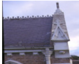
christ church old dandenong road dingley village roof view