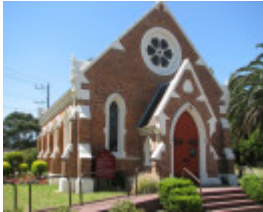
CHRIST CHURCH SOHE 2008