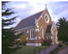
1 christ church old dandenong road dingley village front view