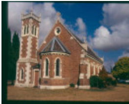
H00225 1 christ church dingley feb 2003