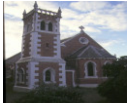
christ church old dandenong road dingley village front elevation