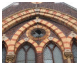
FORMER WESLEYAN CHURCH AND MODEL SUNDAY SCHOOL SOHE 2008