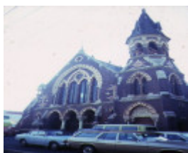
1 former wesleyan church & model school sydney road brunswick front view