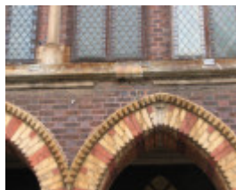
FORMER WESLEYAN CHURCH AND MODEL SUNDAY SCHOOL SOHE 2008