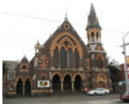
FORMER WESLEYAN CHURCH AND MODEL SUNDAY SCHOOL SOHE 2008