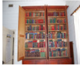
H0550 Briag library