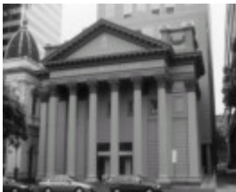
former baptist church house front elevation