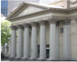
FORMER BAPTIST CHURCH HOUSE SOHE 2008