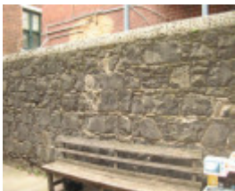
Basalt wall of coursed rubble, west boundary