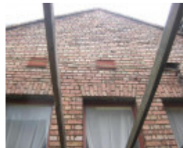
Upper west facade of school Aug2014