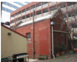
East end of Succah building of 1915 Aug2014