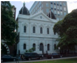
east melbourne synagogue albert street east melbourne front view oct1999