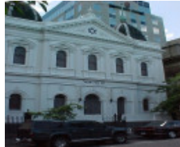
east melbourne synagogue albert street east melbourne entrance view oct1999