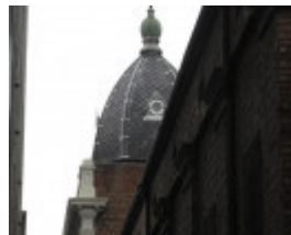
Repaired slatework to east dome Aug2014