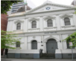
EAST MELBOURNE SYNAGOGUE SOHE 2008