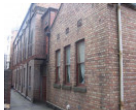
View from north-east of site towards Albert Street