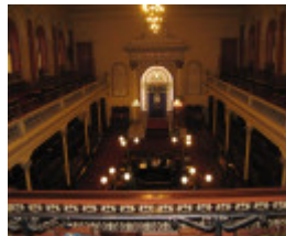
View from choir gallery (now library) aug2014