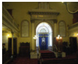
Interior towards Ark