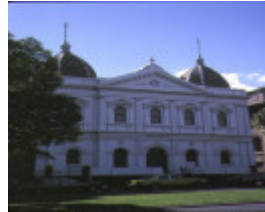
1 east melbourne synagogue albert street east melbourne front view sep1978