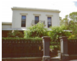
1 braemar gerorge street eat melbourne main facade jan 2000