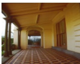
braemar geoerge street east melbourne verandah from east jan 2000