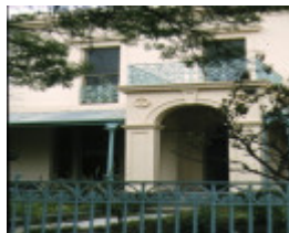
Braemar George Street East Melbourne Exterior Entrance 2000