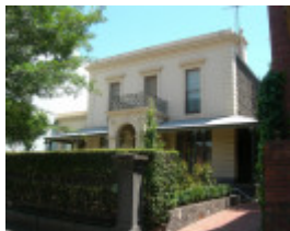
BRAEMAR SOHE 2008