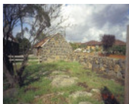
h00979 ziebells farm gardenia st thomastown barn outbuilding north end she project 2003