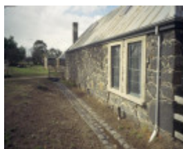
h00979 ziebells farm gardenia st thomastown farmhouse north wall stone gutter she project 2003