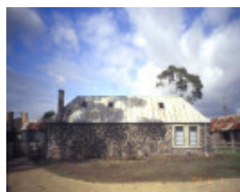
h00979 ziebells farm gardenia st thomastown view of farmhouse she project 2003