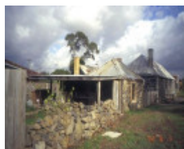
h00979 ziebells farm gardenia st thomastown drying shed she project 2003