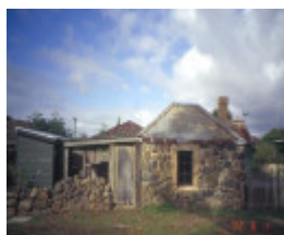
h00979 ziebells farm gardenia st thomastown smokehouse laundry outbuilding she project 2003