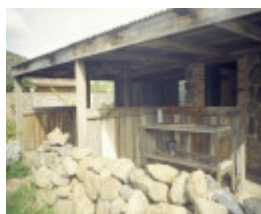
h00979 ziebells farm gardenia st thomastown drying shed east end she project 2003