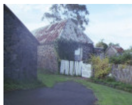
1 ziebell's farmhouse gardenia road thomastown front view