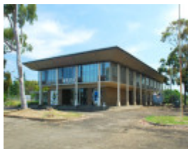
FORMER BP REFINERY ADMINISTRATION BUILDING SOHE 2008