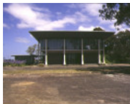
1 former bp refinery administration building the esplanade crib point front view jan1994