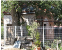
LYNDHURST HALL SOHE 2008