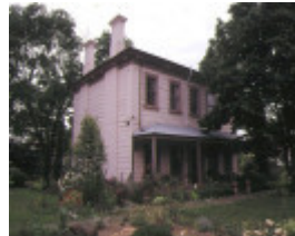
1 lyndhurst hall walhalla street coonans hill front view dec1992