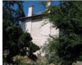
LYNDHURST HALL SOHE 2008