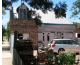
LYNDHURST HALL SOHE 2008