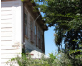
LYNDHURST HALL SOHE 2008