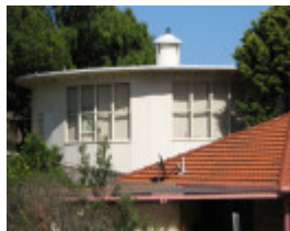
ROUND HOUSE SOHE 2008