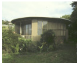
1 round house frankston front view jan1993