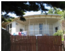
ROUND HOUSE SOHE 2008