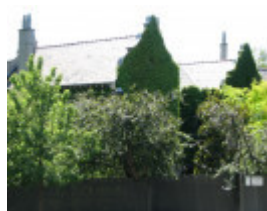
THANES SOHE 2008