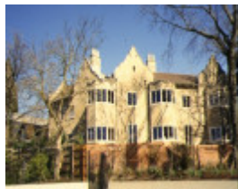
Wyalla Monaro Road Kooyong Exterior View August 1994