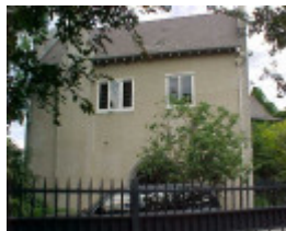
Wyalla Monaro Road Kooyong West Wing November 2001