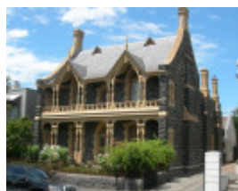
RESIDENCE SOHE 2008