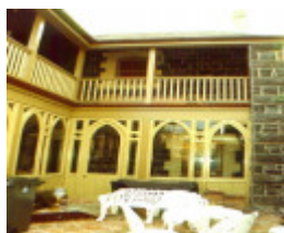
h61 157 hotham street rear courtyard june2000