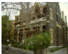
157 hotham street verandah restoration