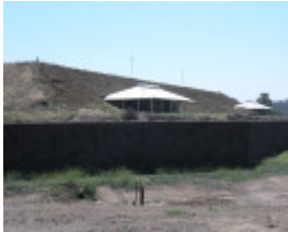
JACK'S MAGAZINE SOHE 2008