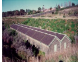
1 jacks magazine gordon street footscray magazine sep1995