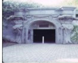
1 underground car park university of melbourne parkville walking entrance former colonial bank entrance may1989