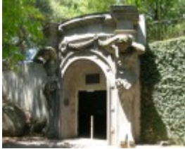
UNDERGROUND CAR PARK SOHE 2008