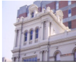
aubrey bowen wing royal victorian eye & ear hospital morrison place east melbourne facade detail jan1998