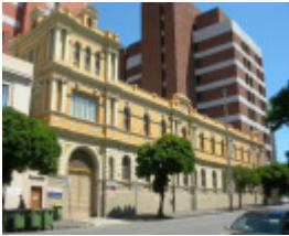
ROYAL VICTORIAN EYE AND EAR HOSPITAL, AUBREY BOWEN WING SOHE 2008