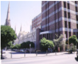
aubrey bowen wing royal victorian eye & ear hospital morrison place east melbourne corner view jan1998