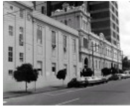
aubrey bowen wing royal victorian eye & ear hospital morrison place east melbourne view from street