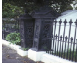
foynes powlett street east melbourne front gates oct1980