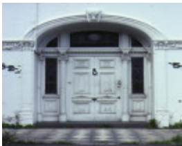
foynes powlett street east melbourne front entrance oct1980