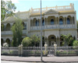
FOYNES SOHE 2008