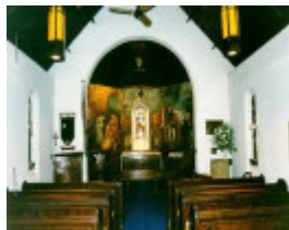
1 st james the less mt eliza