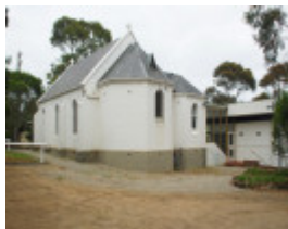
ST JAMES THE LESS ANGLICAN CHURCH SOHE 2008