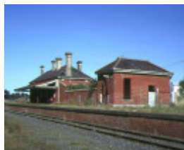
1 avoca railway station york avenue avoca trackside view nov1993