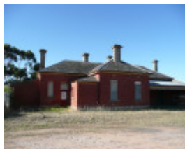
AVOCA RAILWAY STATION SOHE 2008