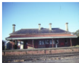
avoca railway station york avenue avoca front view aug1984