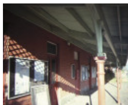
avoca railway station york avenue avoca platform view aug1984