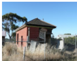
AVOCA RAILWAY STATION SOHE 2008