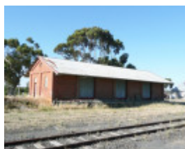
AVOCA RAILWAY STATION SOHE 2008