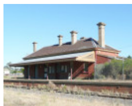
AVOCA RAILWAY STATION SOHE 2008