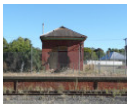
AVOCA RAILWAY STATION SOHE 2008