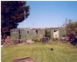
h01297 the grange belgrave street coburg stables she project 2003