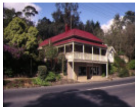
1 former warrandyte wine hall yarra street warrandyte front view