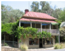
FORMER WARRANDYTE WINE HALL SOHE 2008