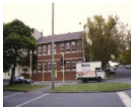
former christian brothers college external back