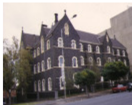
1 former christian brothers college external front