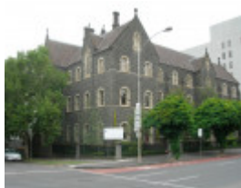
CATHEDRAL COLLEGE SOHE 2008