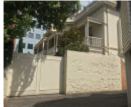
Mena Place 2