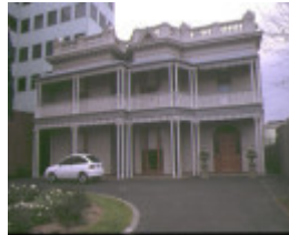
1 elizabeth house wellington prd east melb front view