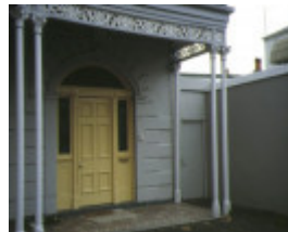
elizabeth house wellington prd east melb external entrance