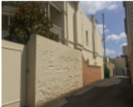
Mena Place 3