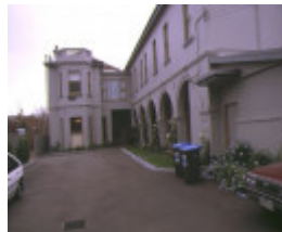
elizabeth house wellington prd east melb side view drive