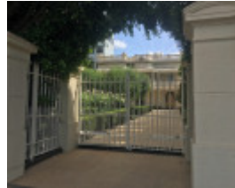
Right gate - Wellington Parade