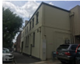
Rear buildings - George Street