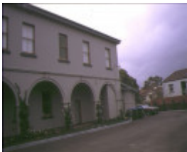
elizabeth house wellington prd east melb external archways