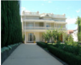
ELIZABETH HOUSE SOHE 2008