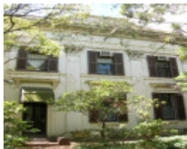
VIRGINIA SOHE 2008