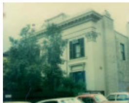
1 virginia wellington parade east melbourne front view