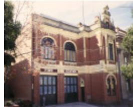
1 former bendigo fire station front elevation apr1997