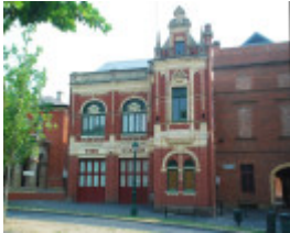
FORMER BENDIGO FIRE STATION SOHE 2008