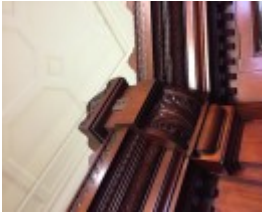
EASTERN HILL FIRE STATION July 2016