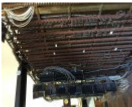
EASTERN HILL FIRE STATION July 2016