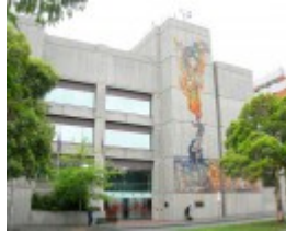
EASTERN HILL FIRE STATION SOHE 2008