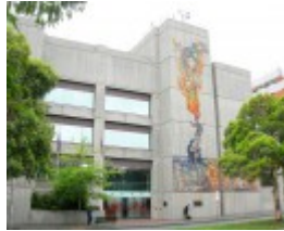
EASTERN HILL FIRE STATION SOHE 2008