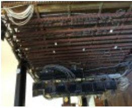
EASTERN HILL FIRE STATION July 2016