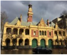
EASTERN HILL FIRE STATION July 2016