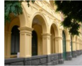
EASTERN HILL FIRE STATION SOHE 2008