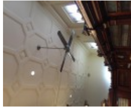
EASTERN HILL FIRE STATION July 2016