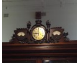
EASTERN HILL FIRE STATION July 2016