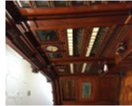
EASTERN HILL FIRE STATION July 2016