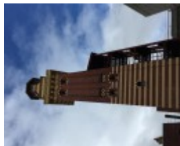
EASTERN HILL FIRE STATION July 2016