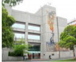
EASTERN HILL FIRE STATION SOHE 2008