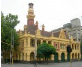
EASTERN HILL FIRE STATION SOHE 2008