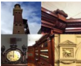
EASTERN HILL FIRE STATION July 2016