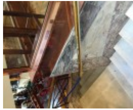
EASTERN HILL FIRE STATION July 2016