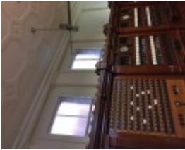
EASTERN HILL FIRE STATION July 2016