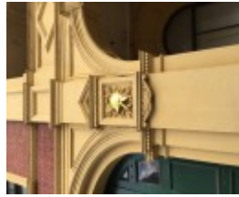
EASTERN HILL FIRE STATION July 2016