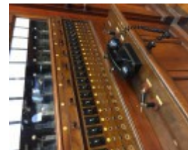
EASTERN HILL FIRE STATION July 2016