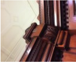
EASTERN HILL FIRE STATION July 2016