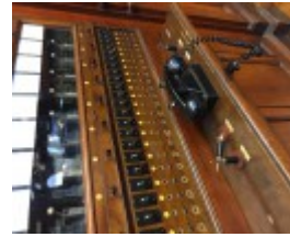
EASTERN HILL FIRE STATION July 2016