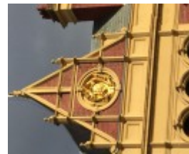
EASTERN HILL FIRE STATION July 2016