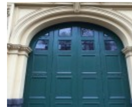
EASTERN HILL FIRE STATION July 2016