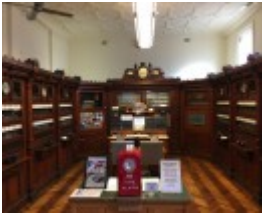
EASTERN HILL FIRE STATION July 2016