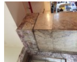
EASTERN HILL FIRE STATION July 2016