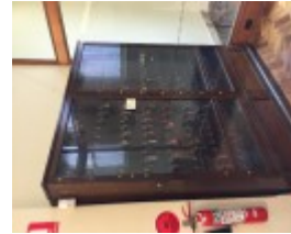
EASTERN HILL FIRE STATION July 2016