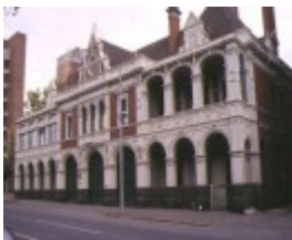
1 eastern hill fire station victoria parade east melbourne front view feb 1994