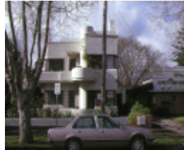
1 windermere flats broadway elwood front elevation jul1989