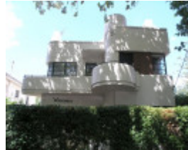
WINDERMERE FLATS SOHE 2008