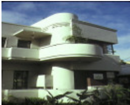
windermere flats broadway elwood detail of central curves