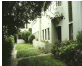
windermere flats broadway elwood side view & garden nov1992