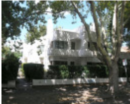
WINDERMERE FLATS SOHE 2008