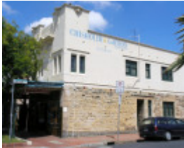
FORMER CHEMIST SHOP SOHE 2008