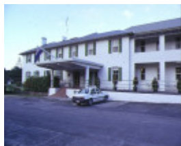
1 erskine house mountjoy parade lorne front view