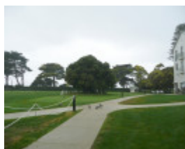
ERSKINE HOUSE SOHE 2008