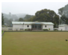
ERSKINE HOUSE SOHE 2008