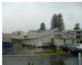
ERSKINE HOUSE SOHE 2008