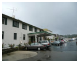
ERSKINE HOUSE SOHE 2008