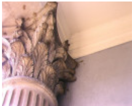
earlsbrae hall essendon detail column capital