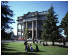
1 earlsbrae hall essendon front view