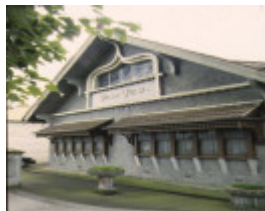
1 park view racecourse road flemington front elevation apr1996