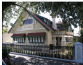
PARK VIEW SOHE 2008