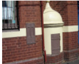
h00048 richmond south post office april05 exterior post boxes