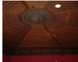
h00048 richmond south post office april05 ceiling public