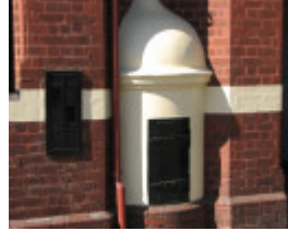
FORMER RICHMOND SOUTH POST OFFICE SOHE 2008