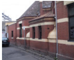
H0048 FORMER RICHMIND SOUTH POST OFFICE LHA 2015 2.JPG