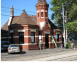
FORMER RICHMOND SOUTH POST OFFICE SOHE 2008