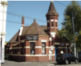
h00048 richmond south post office april05 exterior5