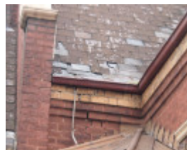
H0048 FORMER RICHMIND SOUTH POST OFFICE LHA 2015 4.JPG