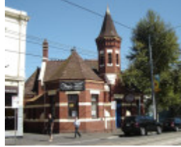
h00048 1 richmond south post office april05 exterior4