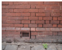
H0048 FORMER RICHMIND SOUTH POST OFFICE LHA 2015 5.JPG