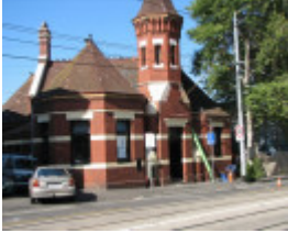
FORMER RICHMOND SOUTH POST OFFICE SOHE 2008