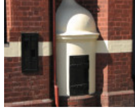
FORMER RICHMOND SOUTH POST OFFICE SOHE 2008