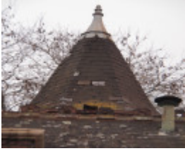
H0048 FORMER RICHMIND SOUTH POST OFFICE LHA 2015 6.JPG