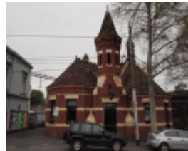
H0048 FORMER RICHMIND SOUTH POST OFFICE LHA 2015 1.JPG