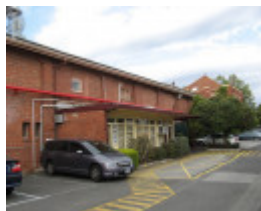
Former Wertheim factory Richmond_west end of south wing_Feb 08