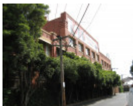
Former Wertheim factory Richmond_north wing incl Heinz additions_Feb 08