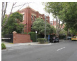
Former Wertheim factory_Bendigo St_Feb 08