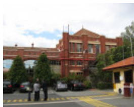
Former Wertheim Factory Richmond_southern elevation of east wing_Feb 08