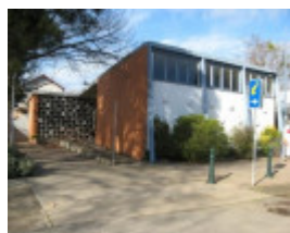
Former Shire Offices_Benalla_JC_Aug 08