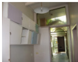
Former Benalla Shire Offices_kitchen cupboards_KJ_Sept 08