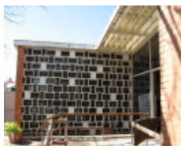
Former Shire Offices_Benalla_main entrance_KJ_5/9/08