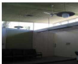
Former Shire Offices_Benalla_COuncil chamber with lights, sunshade, seats_KJ_5/9/08