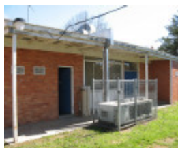
Former Benalla Shire Offices_rear wall_KJ_Sept 08