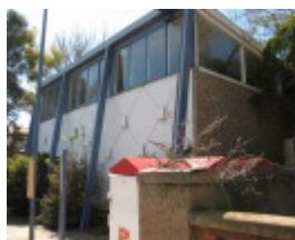
Former Shire Offices_Benalla_front_KJ_5/9/08