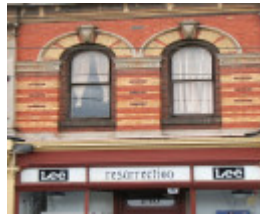
SHOPS SOHO 2008