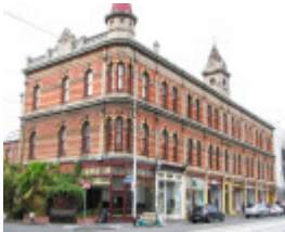
SHOPS SOHO 2008