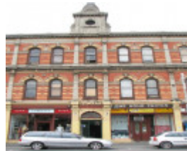
SHOPS SOHO 2008