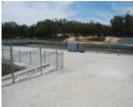
TORRUMBARRY WEIR LOCK CHAMBER, STEAM BOILER AND STEAM WINCH COMPLEX SOHE 2008