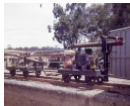
h00993 torrumbarry weir lock chamber steam boiler and steam winch complex torrumbarry drop bar hydraulic operated she project 2004