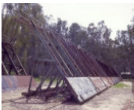
h00993 torrumbarry weir lock chamber steam boiler and steam winch complex torrumbarry detheridge weir trestles she project 2004