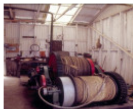
h00993 torrumbarry weir lock chamber steam boiler and steam winch complex torrumbarry winch house interior she project 2004