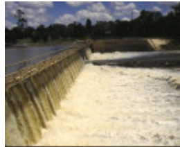
1 torrumbarry weir complex face of weir