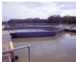
h00993 torrumbarry weir lock chamber steam boiler and steam winch complex torrumbarry lock stream upstream gates she project 2004