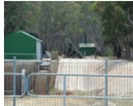
TORRUMBARRY WEIR LOCK CHAMBER, STEAM BOILER AND STEAM WINCH COMPLEX SOHE 2008