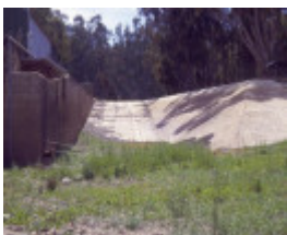
h00993 torrumbarry weir lock chamber steam boiler and steam winch complex torrumbarry trestle runway ramp she project 2004