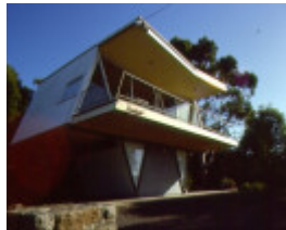
McCraith House Atunga