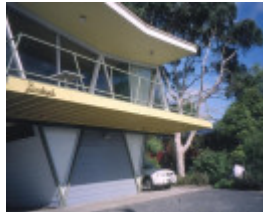
h01906 mccraith house atunga terrace dromana front view she project 2003