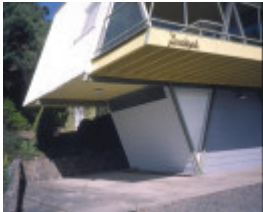
h01906 mccraith house atunga terrace dromana front carport she project 2003