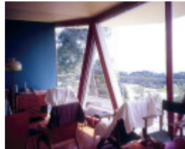
h01906 mccraith house atunga terrace dromana interior she project 2003