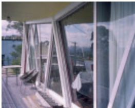
h01906 mccraith house atunga terrace dromana verandah she project 2003