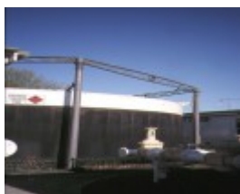
1 hamilton gas holder craig street hamilton gas holder