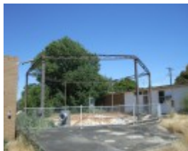
HAMILTON GAS HOLDER SOHE 2008