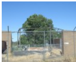
HAMILTON GAS HOLDER SOHE 2008