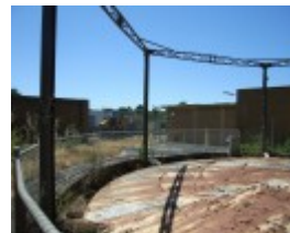
HAMILTON GAS HOLDER SOHE 2008